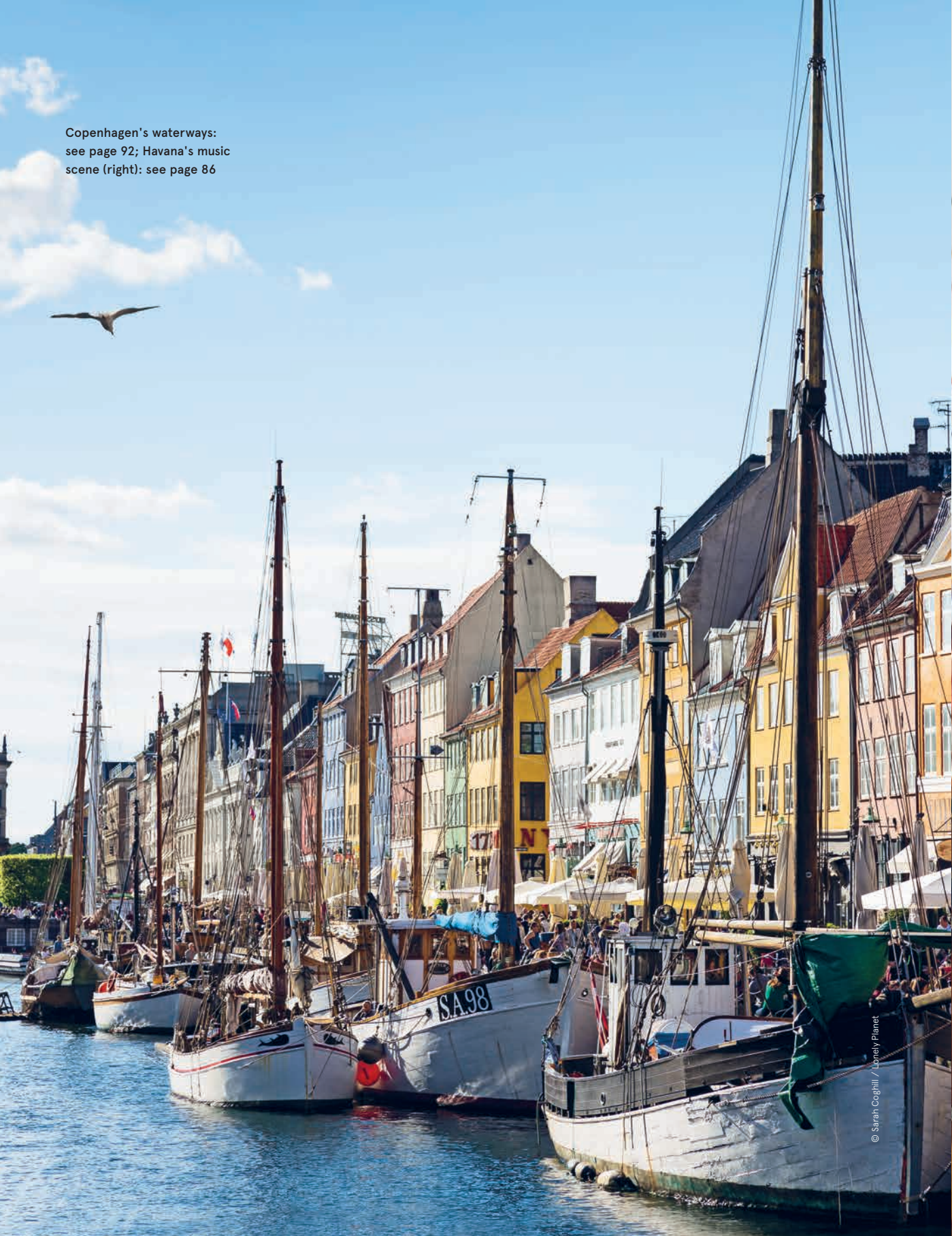
Copenhagen's waterways: see page 92; Havana's music scene (right): see page 86